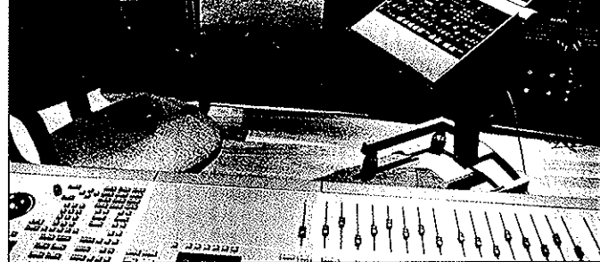
24-bit Studer digital at CTS Studios, London